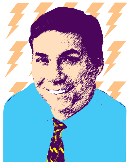
Sponsored by Sesler & Sesler Attorneys at Law

Luncheon & Lecture: Adults $20; Seniors $15; Students $5