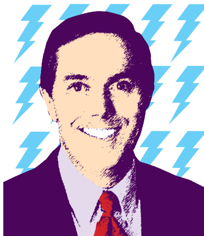
Sponsored by Highmark

Luncheon & Lecture: Adults $20; Seniors $15; Students $5