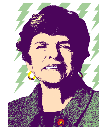
Sponsored by PNC Bank

Luncheon & Lecture: Adults $20; Seniors $15; Students $5