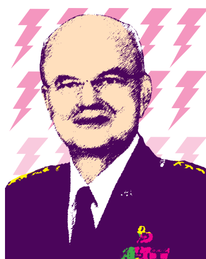
Sponsored by Erie Insurance

Evening Event: Adults $15; Seniors $10; Students $5