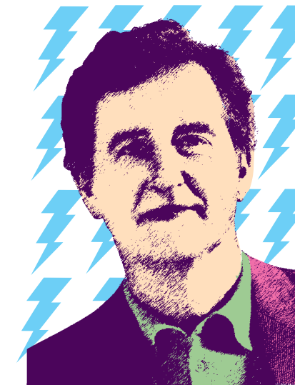
Sponsored by Better Baked Foods, Inc.

Evening Event: Adults $15; Seniors $10; Students $5